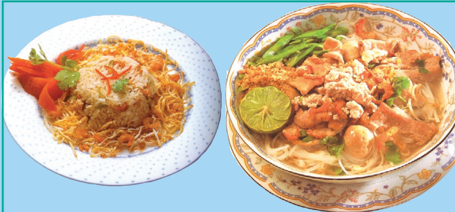
SPICY RICE & NOODLES