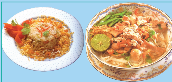
SPICY RICE & NOODLES